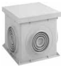
Accessory: underground housing