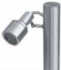
Topspot 430, single, halogen

Modern and creative lighting for gardens, buildings, patios, swimming pools, ponds, biotopes, etc.