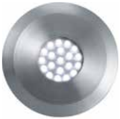
LED effect Superspot

Modern and creative lighting of floors, ceilings, paths or walls for gardens, patios, buildings, swimming pools, ponds, kitchens, bathrooms, living rooms, etc.