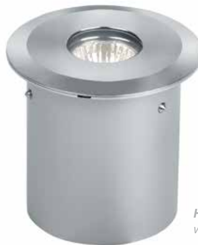
Halogen Superspot with aluminium heat sink

WORLD PREMIERE Swiss patent German utility model