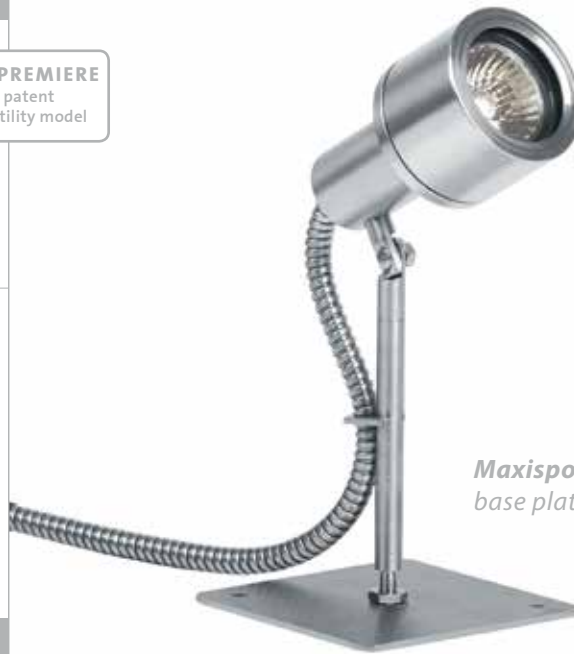
Maxispot Halogen, mounted on base plate and medium-height luminaire holder