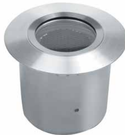
High-power LED Honeycomb Spot

WORLD PREMIERE Swiss patent German utility model