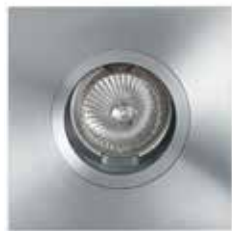
Halogen Honeycomb Spot, square