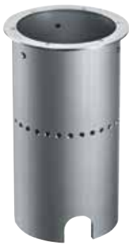
Mounting tube with ball catch

WORLD PREMIERE Swiss patent German utility model