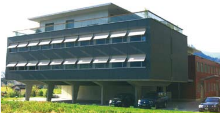
Production and administration